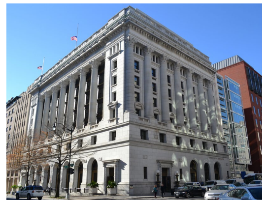
740 15 th Street, NW